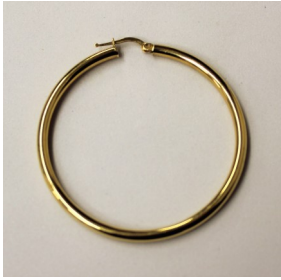
Best Gold Hoop Earring Eric Figueroa