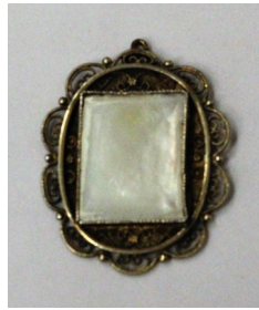
Best Silver Sterling Silver Pendant Eric Figueroa